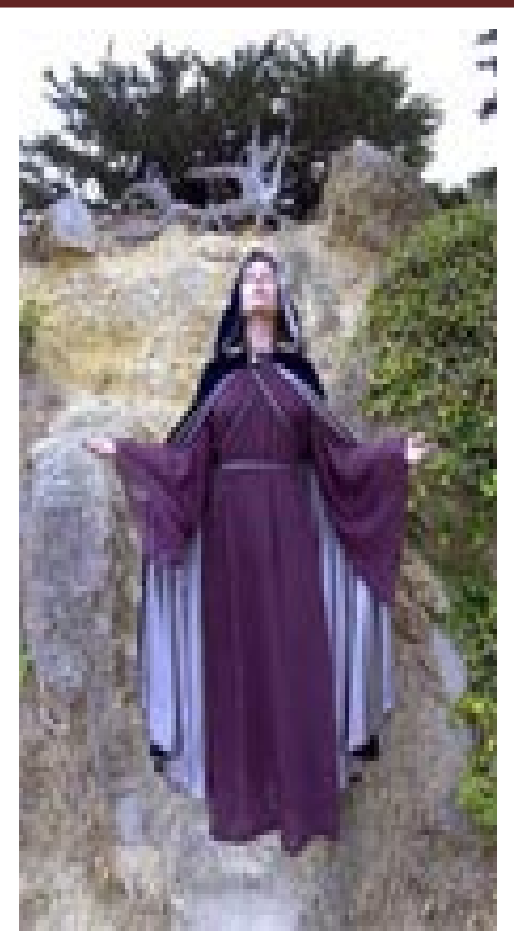
"New World Occult Religion"

Christian books are appearing boldly describing a "New World Occult Religion" that is ready to show a false Christ. When dealing with a conspiracy the size of a "New World Order," everyone unfortunately, becomes suspect of involvement.